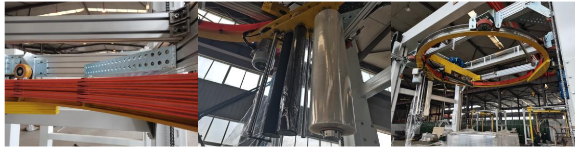
FAST, EFFICIENT, FLEXIBLE AND ECONOMICAL WRAPPING MACHINE